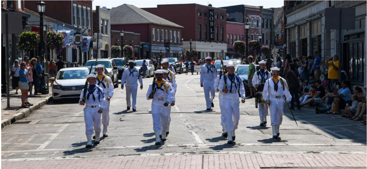
Sailors take part in the CT Maritime Heritage Festival